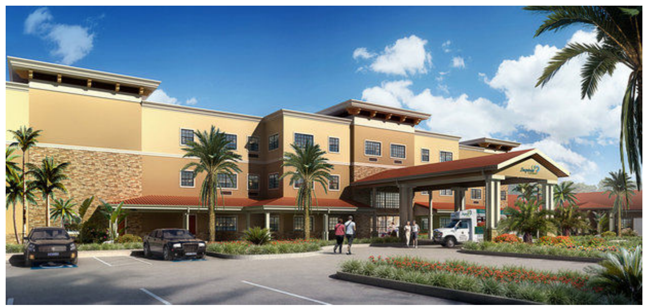
An architectural rendering of a Validus Senior Living community. The Kenner City Council will vote Thursday (June 23) on a proposal to build a facility like this one next to Ochsner Medical Center - Kenner. The project was conceived with the NFL Alumni Association as a part of a plan to provide memory loss support to former players.