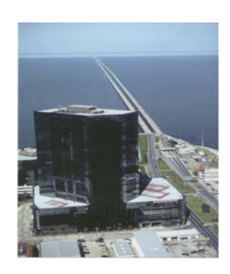
The 24-mile long Lake Pontchartrain Causeway, the longest bridge in the world, connects Jefferson Parish with an area known as the