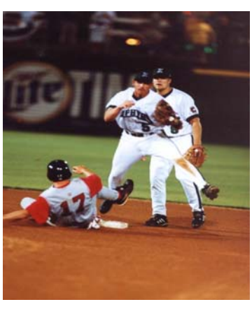
Take in a Zephyrs game!

And no description of the area would be complete without mentioning the dining possibilities. World-class restaurants featuring local and global cuisine are in abundance. Whether casual or sophisticated, you will never run out of finding great places to dine.