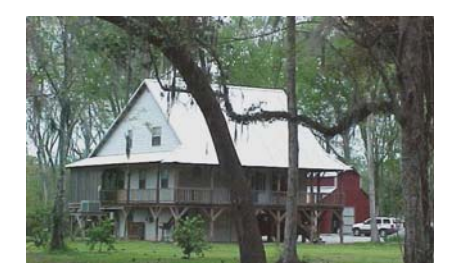
Home located on the westbank.