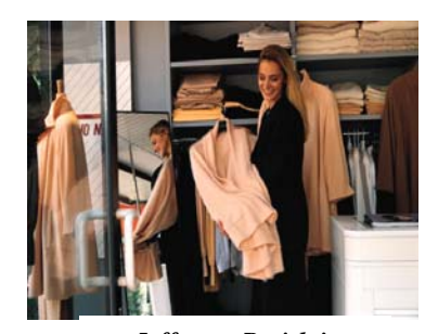
Jefferson Parish is known in the area as a shopping haven.

Residents can find a variety of national chain stores including Barnes & Noble Booksellers, Lowes Home Improvement, Linens –N- Things, Pier 1 Imports and Stein Mart.