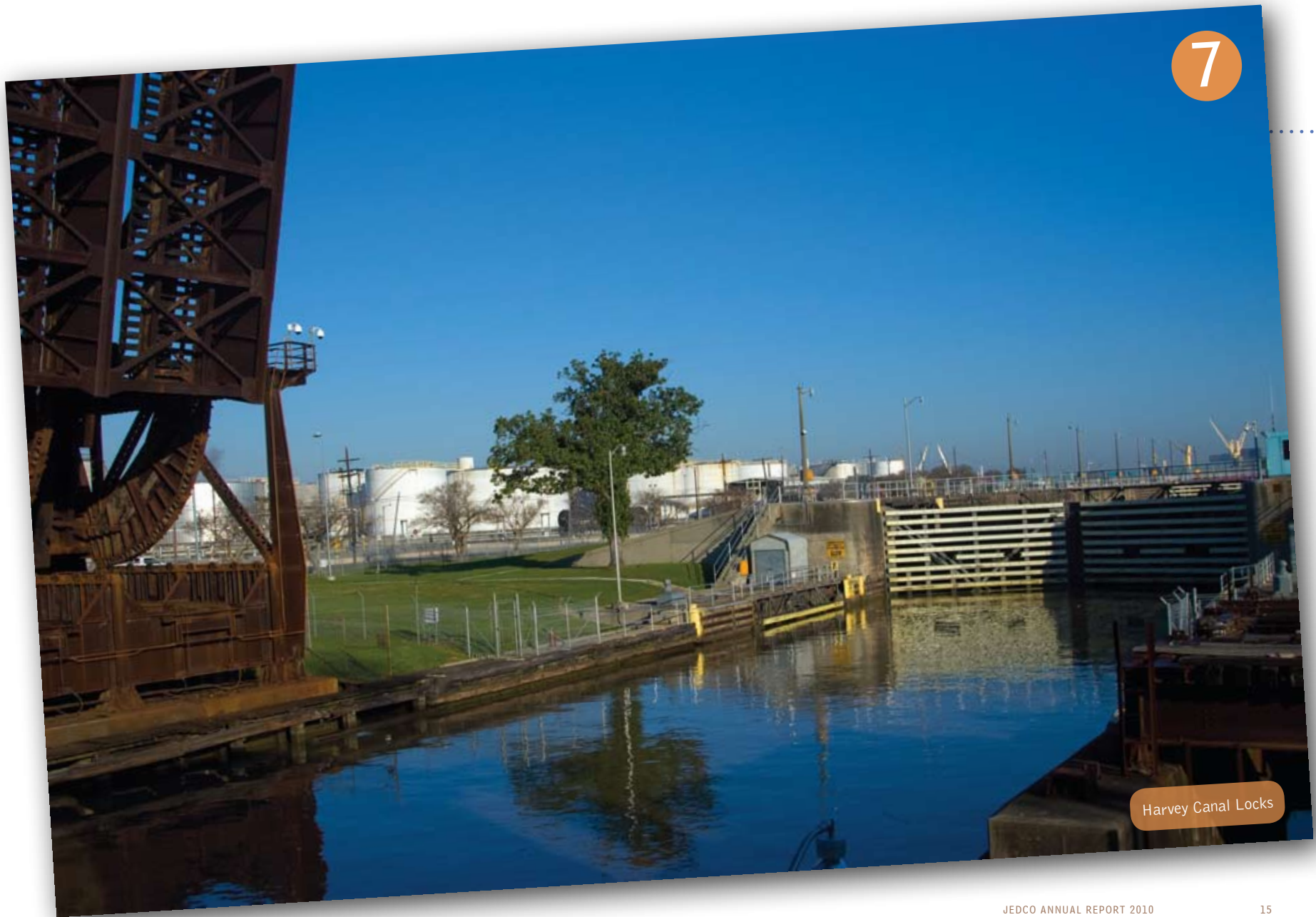
Harvey Canal Locks