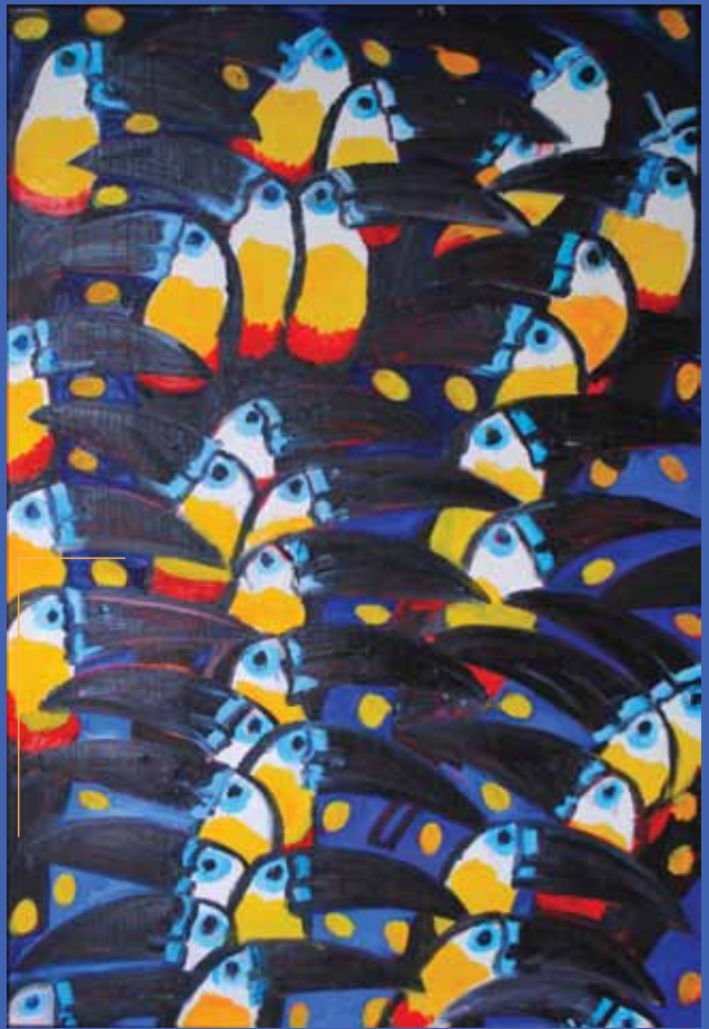
Hunt Slonem, "Toucans," 2006