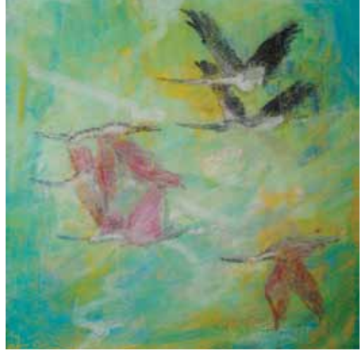
Hunt Sloreem, "Cranes," 2010