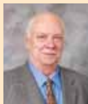
Jimmy Baum Nominating Entry: Councilman Elton Lagasse, District 2