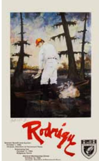
George Rodrigue, "Ducks Unlimited: Day's Catch," 1984