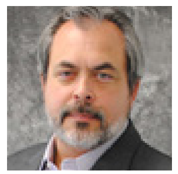
Floyd Simeon Home Builders Association of Greater New Orleans