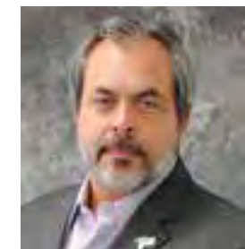
Floyd Simeon Home Builders Association of Greater New Orleans